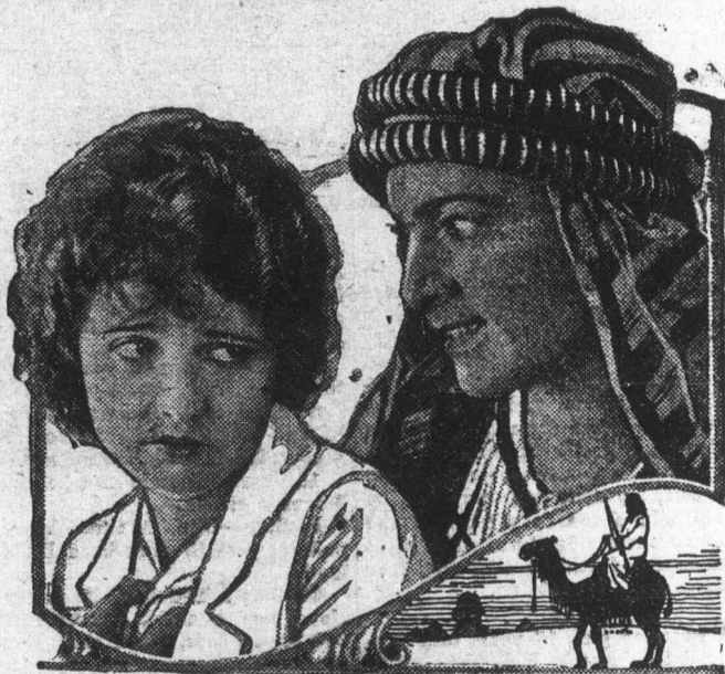
Agnes Ayres and Rudolph Valentino in a Scene from the Paramount Picture, "The Sheik", a George Melford Production.

LYCEUM THEATRE, WATFORD, WEDNESDAY, NOV. 8th