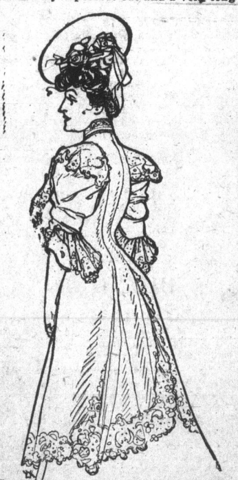
LONG JACKET OF TAFFETA.

White serge tailor made costumes figure among first autumn fancies. The chic of these costumes as exploited by Parisiennes is contributed to a large extent by a perfect cut and a very long