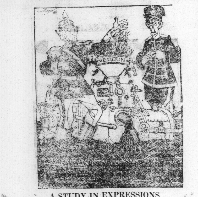
A STUDY IN EXPRESSIONS

I'M NO UNCLE, SA Brooklyn Daily Eagle, N