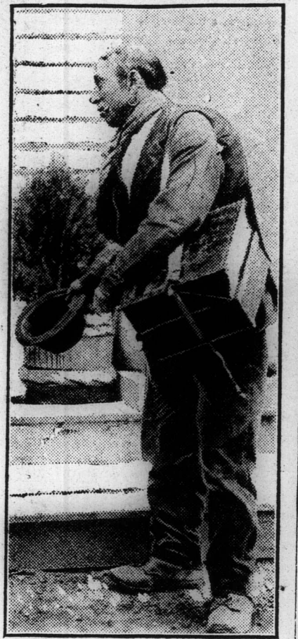
Quabba Appears at Stanley Hall.

Half angrily she ordered Lovell to return it to the stable, and after Lovell, with the equipage and Quabba, the latter uttering expressions of his gratitude, had turned the corner of the great house, "I am not going so very