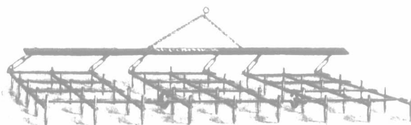
Diamond Smoothing Harrows.

Exceptionally strong. Steel bars connected by malleable iron angle blocks. No holes in the frame, teeth being attached by malleable blocks that grip both tooth and bar firmly. Teeth may be easily removed or reversed. Furnished with either three or four sections.