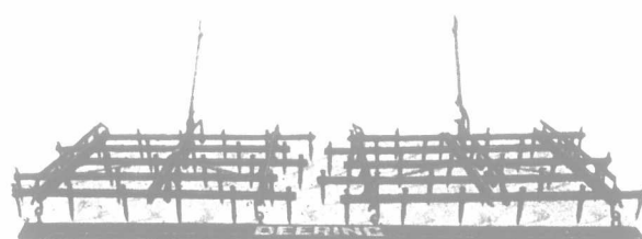
Lever Smoothing Harrows.

Exceptionally strong. Steel bars connected by malleable iron angle blocks. No holes in the frame, teeth being attached by malleable blocks that grip both tooth and bar firmly. Teeth may be easily removed or reversed. Furnished with either three or four sections.