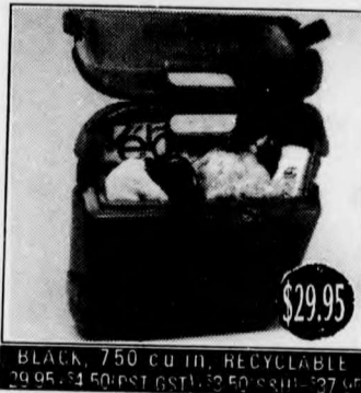
BLACK, 7.50 CU IN. RECYCLABLE 29.95 + $2.00 PST + $1.50 GRV = $33.45