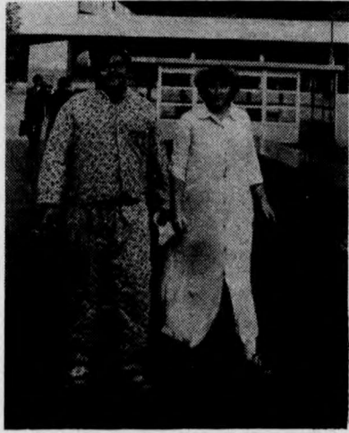
Pyjama clad Yorkites at city hall