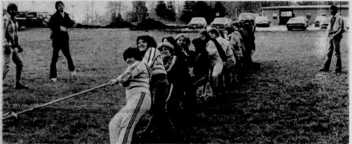
Bethune womens' determined attempt to drag Complex 2 across campus in college relocation event