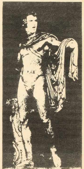
The pseudo-Greek god, Elvis.

The future of the paper right now seems fairly secure, and