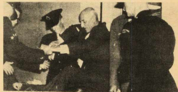
UNB security police prepare to lift industrial magnate K.C. Irving over demonstrators blocking the door at Tuesday's board of governors meeting.