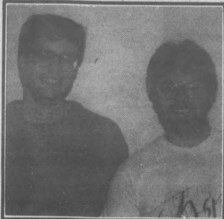
Pokey CHSR V Weasel CHSR II Bumping and Grinding at the Cosmo.