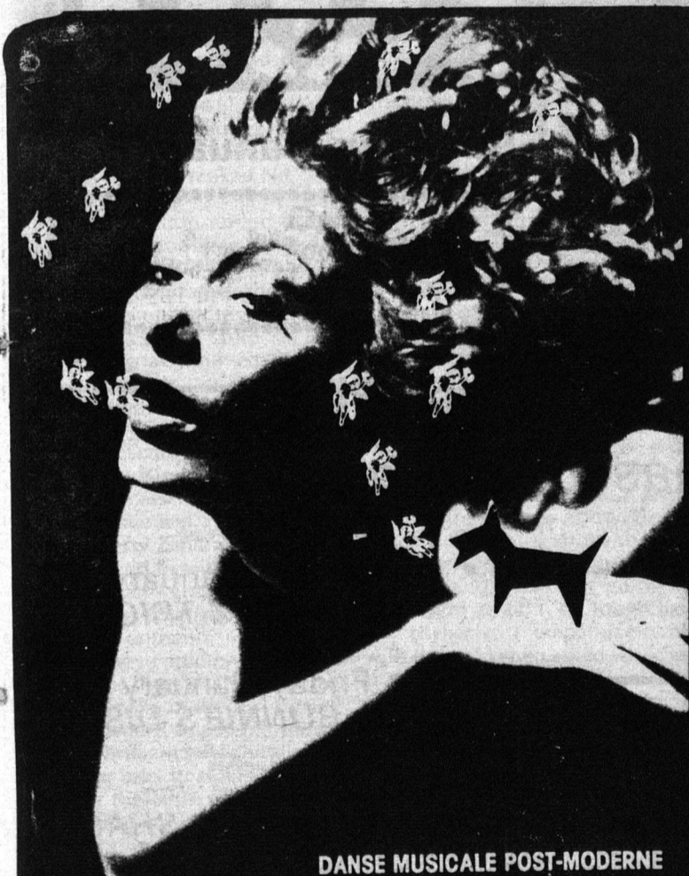
DANSE MUSICALE POST-MODERNE

Are these the ramblings of a creator? Clever double-talk? Is Edouard Lock operating in his own private sphere? One thing is certain: "Businessman in the Process of Becoming an Angel" will be a new and exciting and even challenging dance experience. Is Edmonton ready for it?