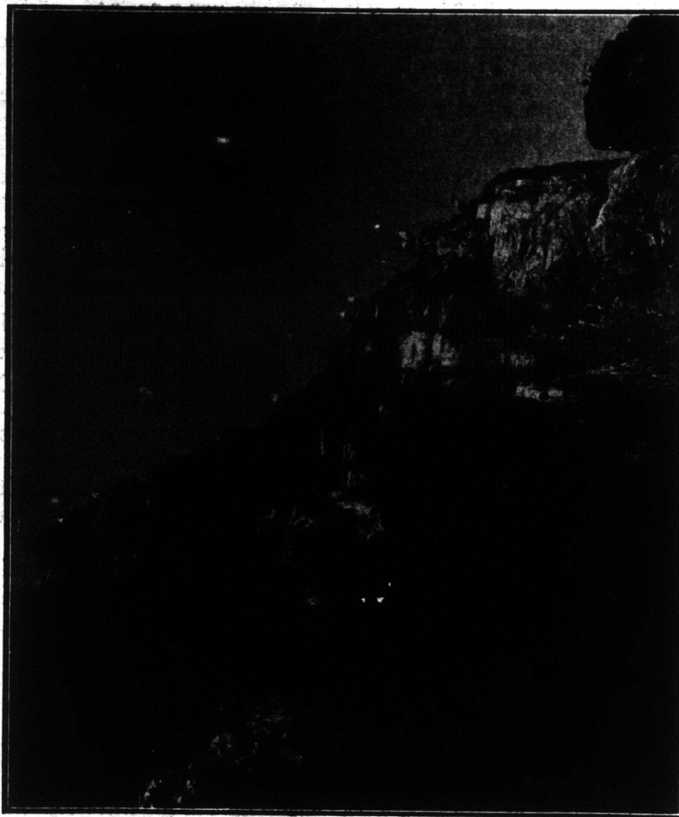
They watched us from every cliff top.

every shelf and ridge and chimney step, in the gullies and crannies, in the sea caves and honeycombs stood, or flew or scrambled the sea fowl.