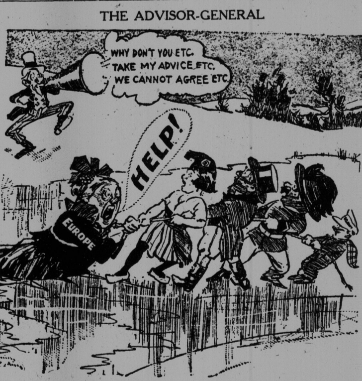
Chorus of Rescuers: "Why don't you come and give a hand, instead of standing there shouting."—From John Ball, London.

Regular value, 75c. yard. Special Price, yard . . . . . 50 cts. An extra fine quality fillet nets in a variety of allover designs and small and medium patterns. White and cream. 36 inches wide. Curtain Goods, Third Floor F. A. DYKEMAN & CO.