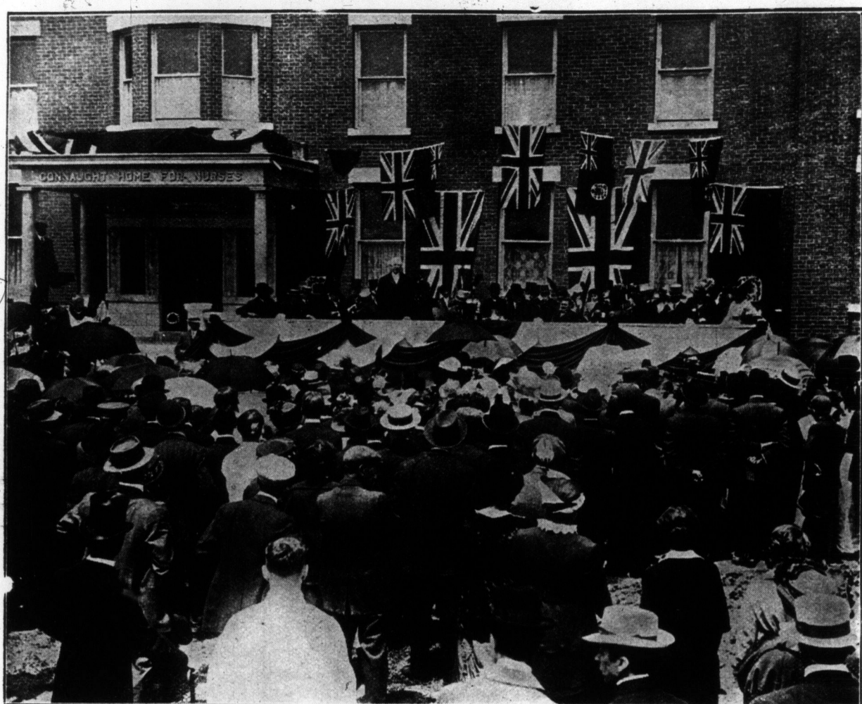
HIS ROYAL HIGHNESS "TURNING THE KEY" OF THE NEW NURSES' HOME AT THE SANITARIUM AT WESTON.