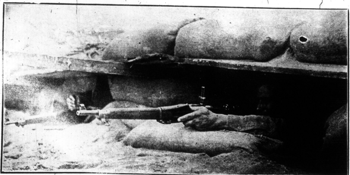
A NEW PICTURE FROM THE AMERICAN-MEXICAN "WAR" THAT GIVES AN IDEA OF HOW "FIGHTING FRED" FUNN ON THE U.S. COMMANDER WHOSE NEW NAME GIVES HIM A CHANCE OF THE PRESIDENCY, HAS BUILT ENTRENCHMENTS IN THE SAND DUNES AROUND VERA CRUZ.