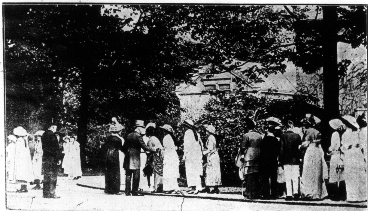
SOME OF THE 1,500 GUESTS AT THE CHILDREN'S PARTY ENTERING CRAIGLEIGH