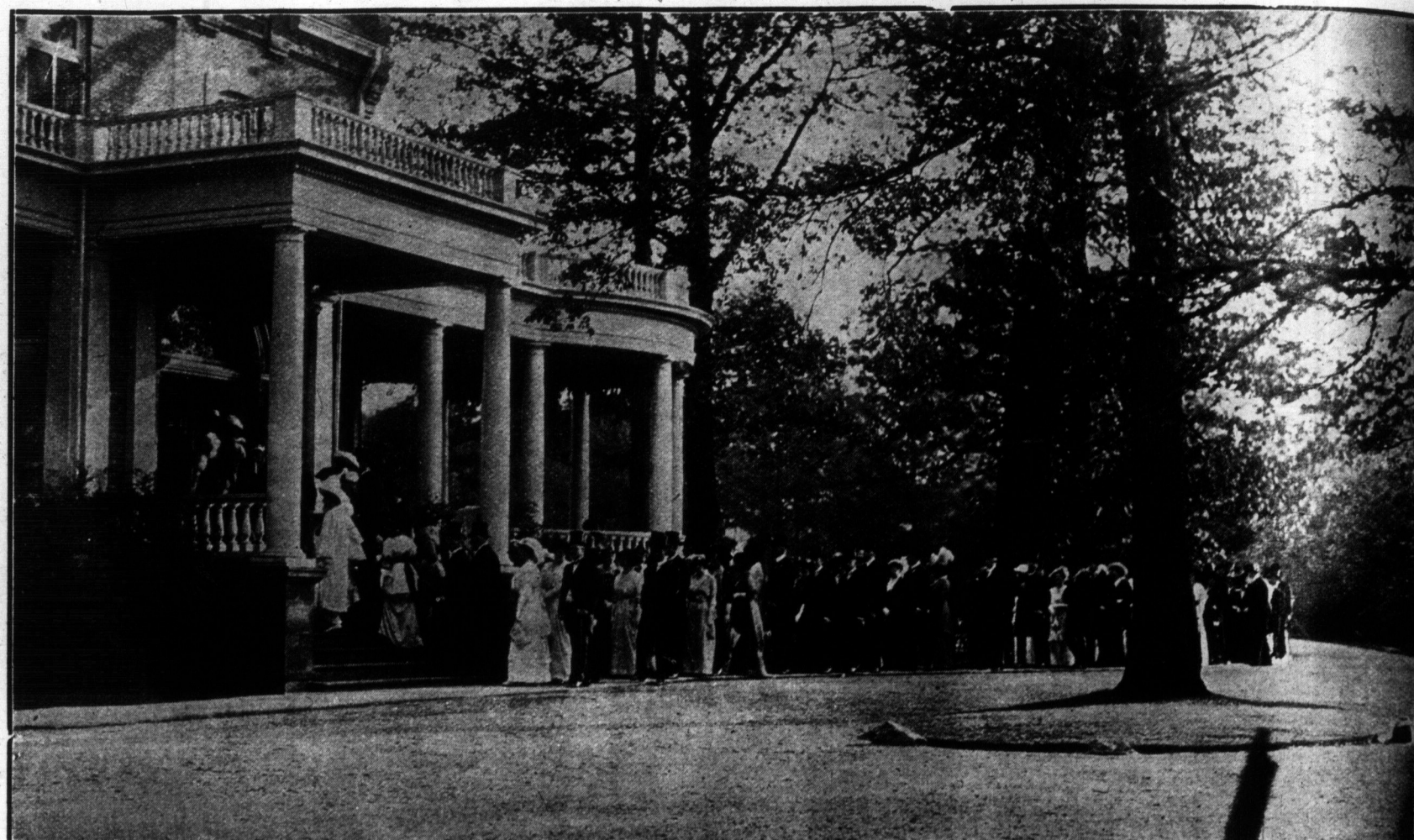
SOME OF THE TWO THOUSAND GUESTS OF THEIR ROYAL HIGHNESSES ARRIVING AT CRAIGLEIGH, SIR EDMUND OSLEBY'S BEAUTIFUL PLACE ON SOUTH DRIVE, ON THE DAY OF THE MOST FASHIONABLE GARDEN PARTY EVER HELD HERE.