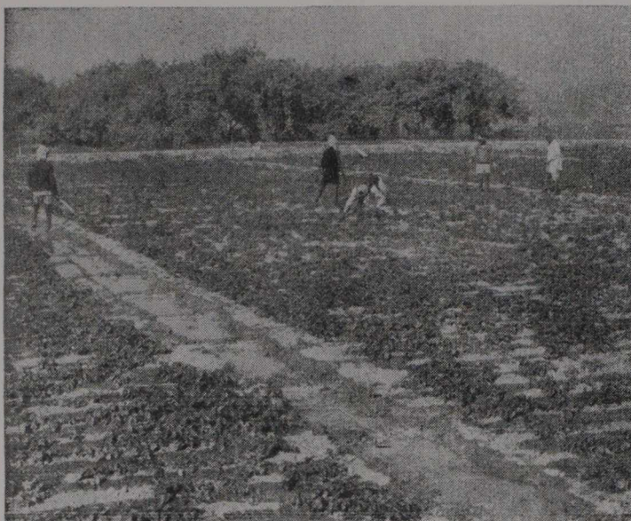
Potato crop on reclaimed land at Neewan Farm, Literacy House, Lucknow.

In 1966 the Young Farmers' Institute was established to meet the need to relate literacy education to agricultural development. Focused on land development, its program aims to make young farmers and their wives functionally literate by teaching and demonstrating improved agricultural practices and agro-industrial techniques in hand with literacy training. The curriculum includes better use of water and land, use of fertilizers and improved seeds, maintenance of pump-sets, operation and repair of tractors and farm machinery, animal husbandry, carpentry and family life welfare.