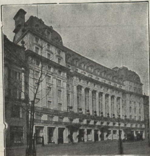
WALDORF HOTEL, ALDWYCH