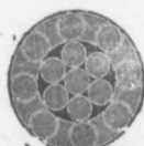
Locked Coil Aerial Cable or Colliery Guide.