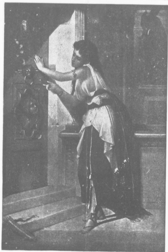
CUPID A PRISONER.