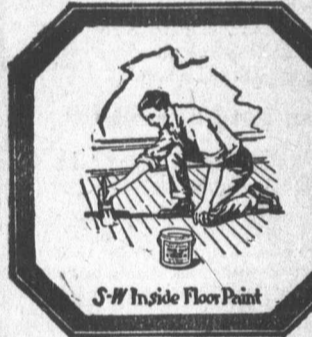
S-W Inside Floor Paint