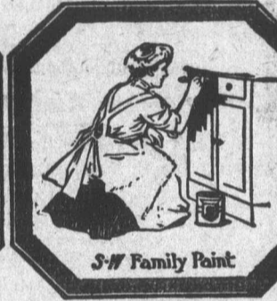
S-W Family Paint