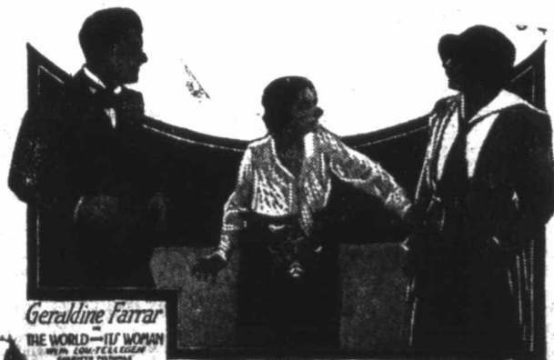
Geraldine Farrar "THE WORLD—IT'S WOMAN" SELECT PICTURES

One of the Really Big Pictures of the Year.