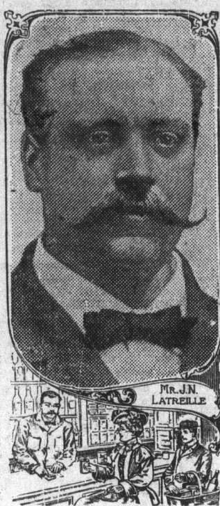
PROMINENT CANADIAN OWES LIFE TO PE-RU-NA.

In filling a lamp in which it is impossible to see the height of the liquid use a definite measure.