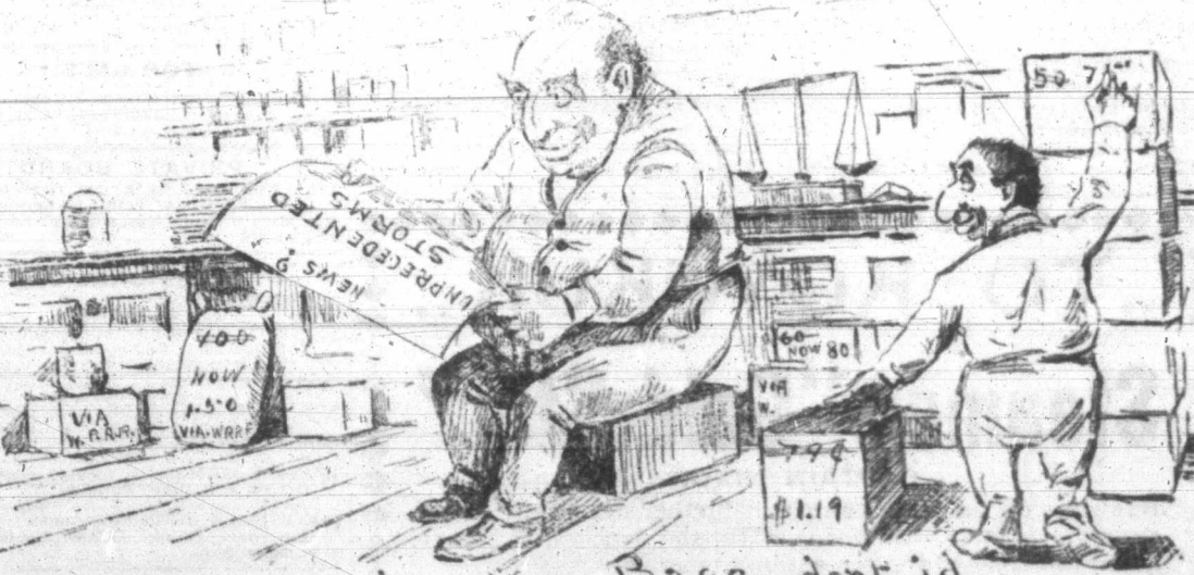
We ship by der Vite Bass, dont id.