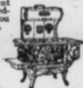
20 in. Oven Back High Closet Enameled Rest. $33.85