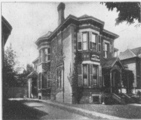
HAMILTON SANATORIUM BUILDING

The term "actual value" is not strictly correct; it is the value put on the property by law, and is in most cases considerably below the true value.