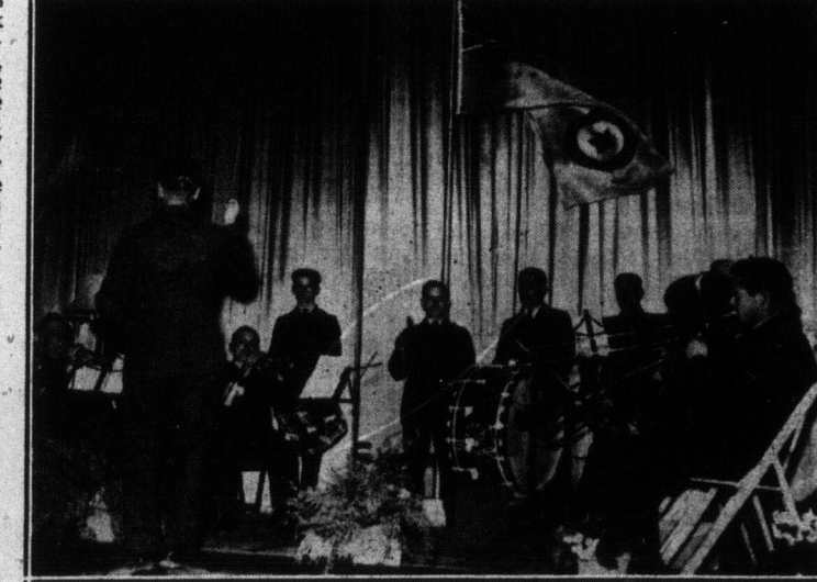
Bringing the Sunday evening concert to a successful conclusion