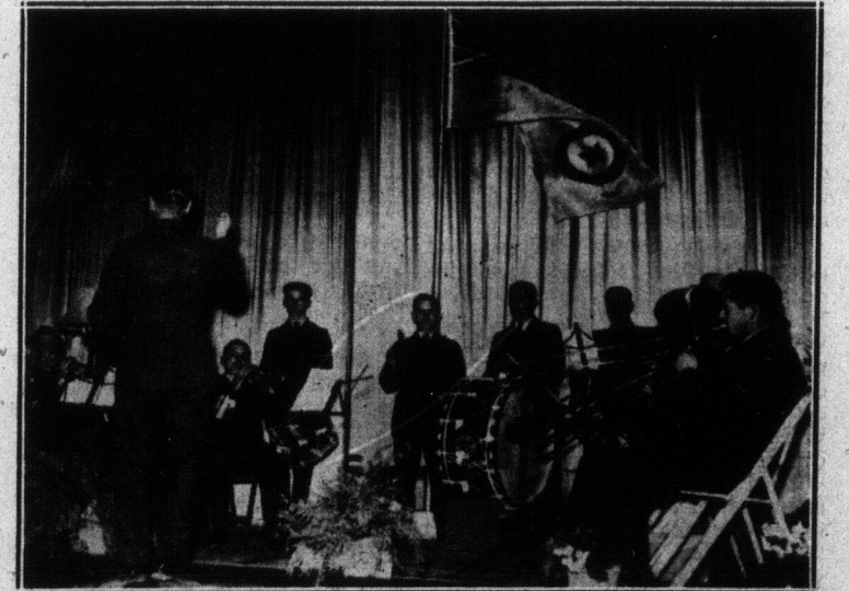
Bringing the Sunday evening concert to a successful conclusion.