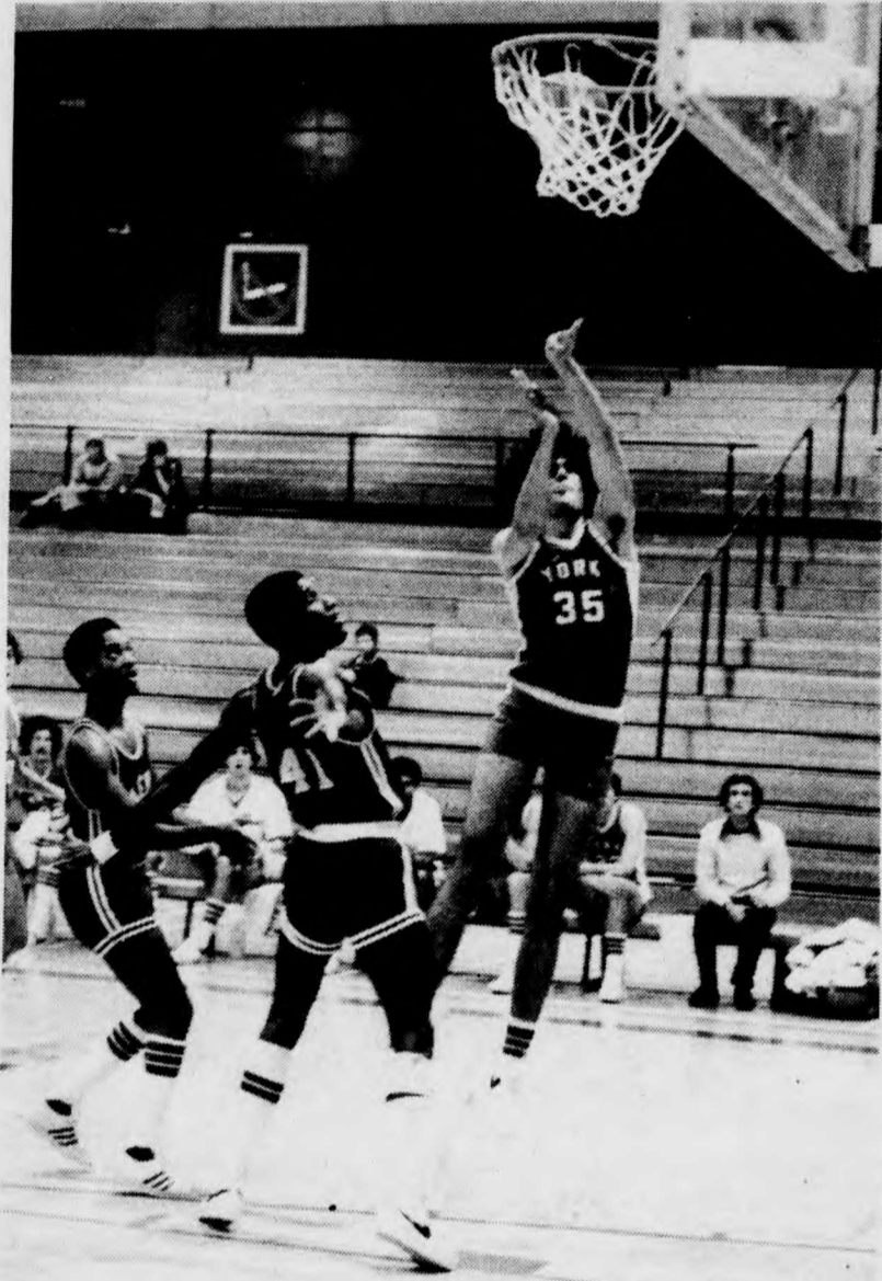
Flying hoopster demonstrates aerial stunt at weekend tournament.