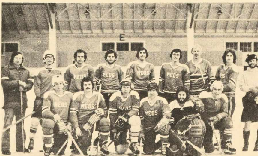
Medicine hockey team wins 7-2 over Law.

Congratulations hockey participants for a high spirited league and a good Championship performance.