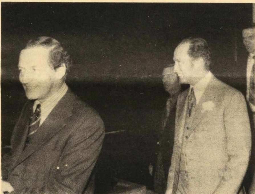
Prime Minister Trudeau follows Premier Regan into the Commonwealth Room at the Hotel Nova Scotian.

This is not a crusade, the Prime Minister said, but an exercise in self government. Leadership cannot provide solutions to problems without "followship". Canadians must be willing to trust each other and the government if the new regulations are to have good results. The Prime Minister stressed his belief in the Canadian public's ability to both trust and assimilate the new rules so inflation can and will be beaten.