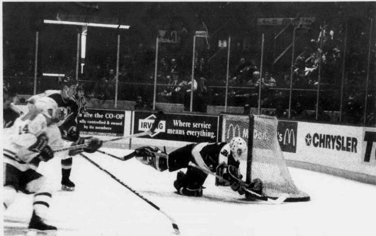
A Bandit goes down to corral a loose puck.