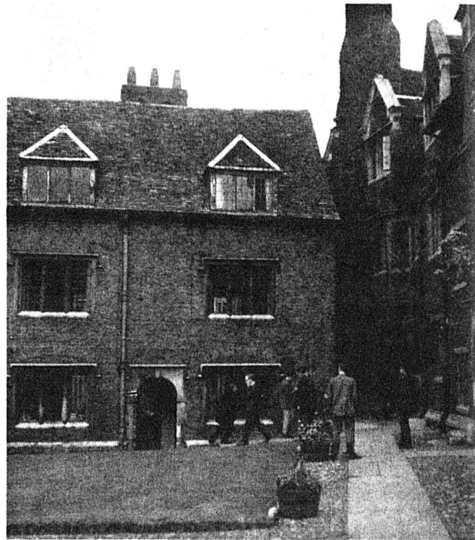
PEMBROKE COLLEGE, CAMBRIDGE