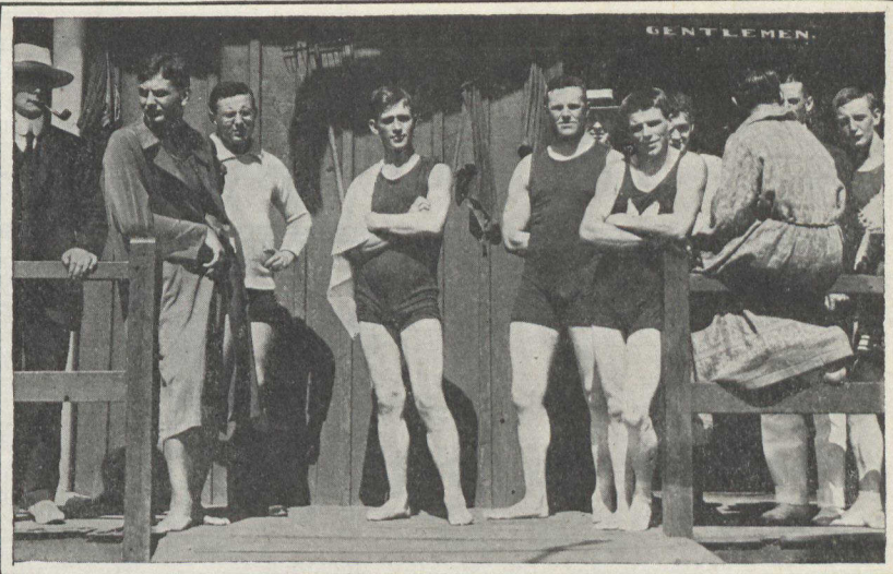
Swimmers of two nations in tournament at Halifax.

The Waegwoltic is to be congratulated for carrying out such a meet. There is much swimming and diving at various resorts during the summer in Canada, but outside of college tanks, competition in the sport is not as common as in others. Such contests produce expert swimmers. They tend to lessen the possibility of fatalities, when people disport themselves on the water.