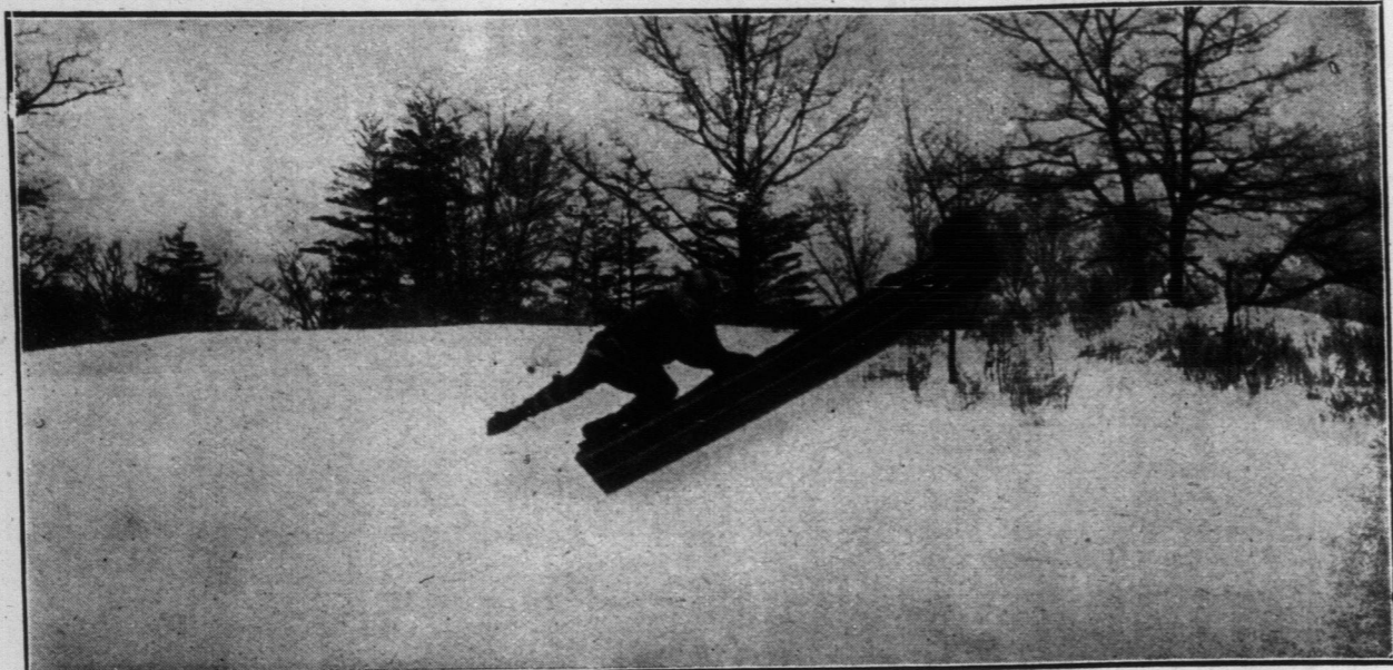
LEAPING TEN FEET INTO THE AIR ON THE SWIFT TOBOGGAN SLIDES OF HIGH PARK.