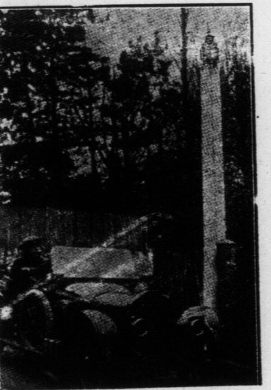
Lighthouse for the roads. An acetylene lamp, erected at Sidcup, England, flashes six times a minute and warns of dangerous crossings.