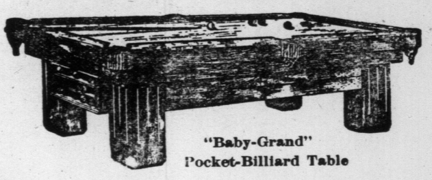
"Baby-Grand" Pocket-Billiard Table

The Brunswick-Balke-Collender Company of Canada, Limited