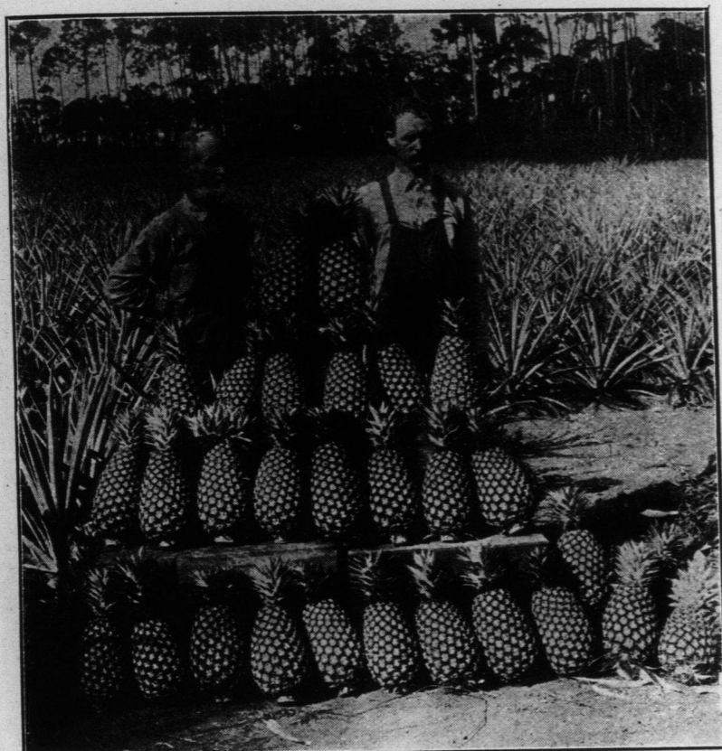
THE FAMOUS SMOOTH CAYENNE PINEAPPLES, SO SUCCESSFULLY GROWN IN THE ISLE OF PINES (ON VIEW AT 34 VICTORIA STREET.)