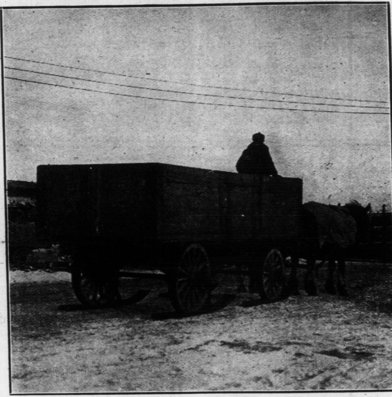
A SUGGESTION FOR TORONTO'S CHANGEABLE WEATHER FROM OTTAWA. A WHEELED WAGON ON QUICKLY-ADJUSTED RUNNERS.