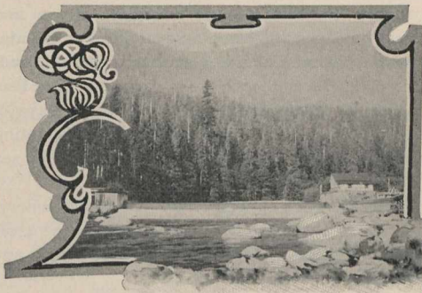
Source of Vancouver's Water Supply.

North Vancouver, where a good hotel is situated, by ferry from the city every hour. From there is reached the quaint old Indian Mission, immediately to the west ; Capilano river canyon, the city waterworks construction,