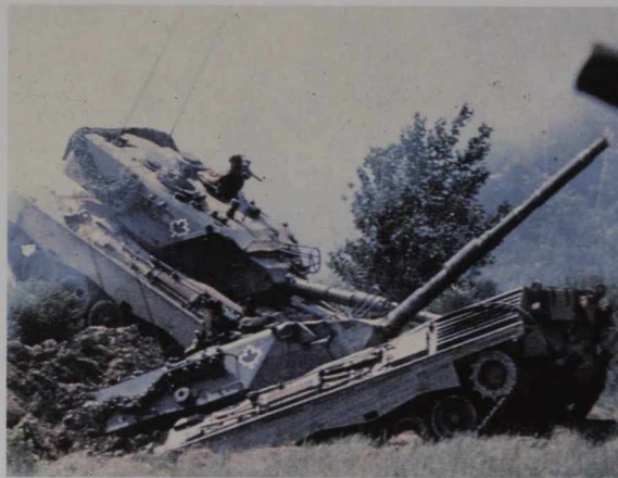
Leopard tanks of Canadian Forces Europe exercising in Germany.

other issues. Part of our credibility is that we do not pretend to be neutral. Part of our authority is that we do not grandstand.