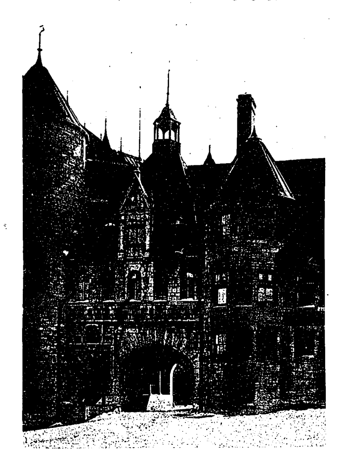
THE OLD WORLD REPRODUCED IN THE NEW.

General James Wolfe, 1726 to 1759; Frontenac, Governor of Canada, 1672; Talon, fiirst Intendant of New France, 1665 to 1672.