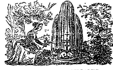
MURRAY & LANMAN'S