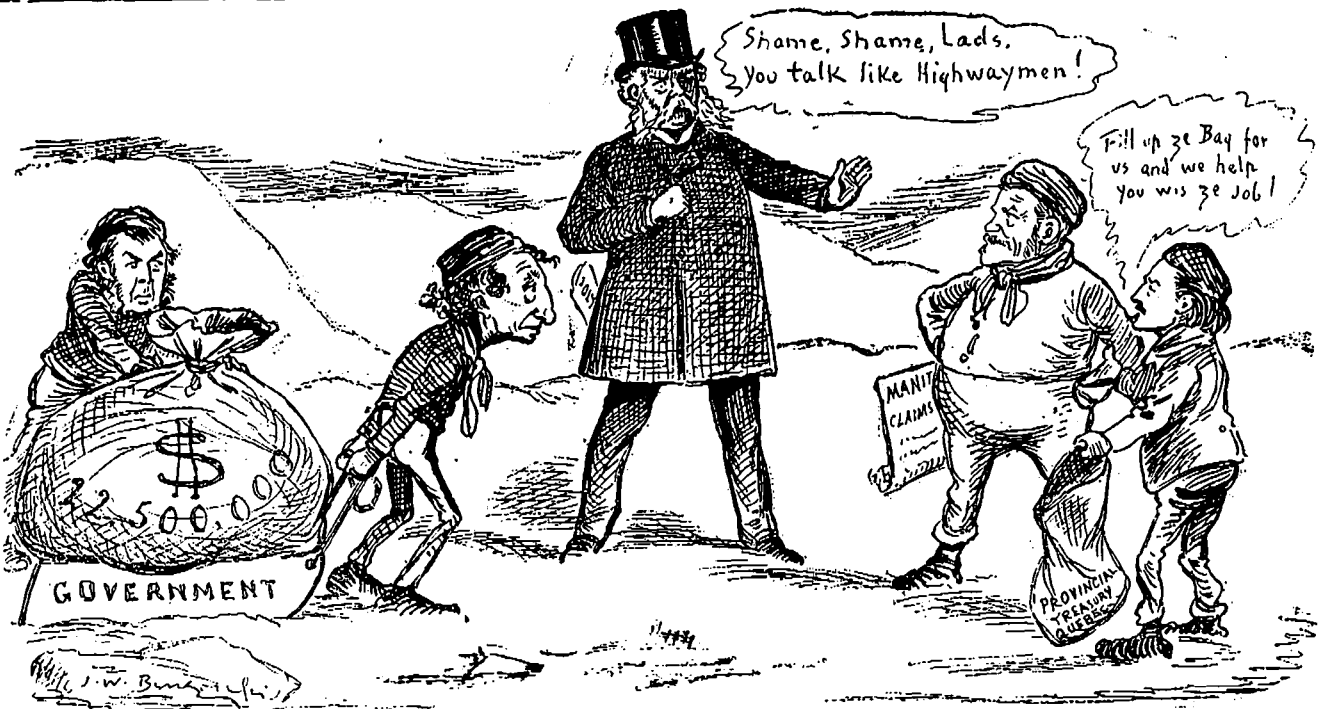
PLAIN WORDS FROM A SQUARE MAN. A REBUKE TO A CONTEMPLATED GAME OF GRAB.

ink idiot. and no mistake. Build it the way the Syndicate does, to be sure.