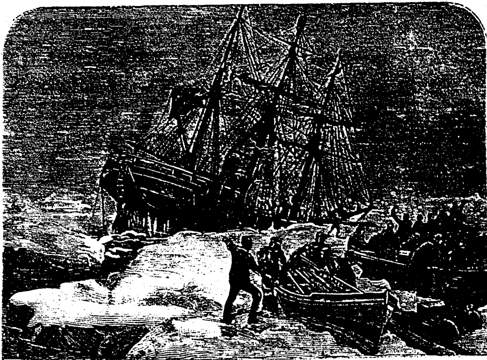
THE FOUNDERING OF THE EIRA, AUGUST 31ST, 1881