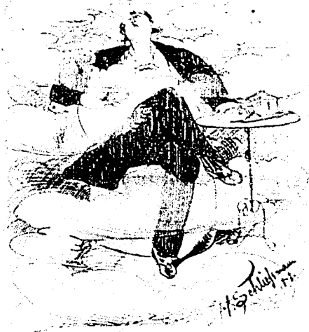
THE HERCULEAN LABOURS OF A CIGARETTE SMOKER.