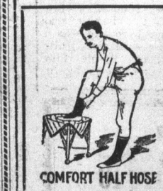
COMFORT HALF HOSE

"Man wants but little here below," but numbered among his few wants is his desire for good sox