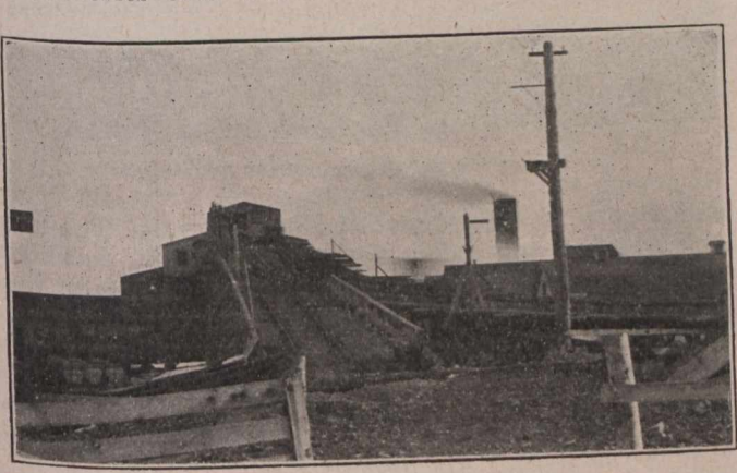
DOMINION No. 3-BANKHEAD APPROACH.

The number of men on the payroll is around 600. At present the mine is double-shifted, and will probably remain so. Reserve Colliery was always a big producer, and on double shift has produced 800,000 tons in one year. The present policy of the Dominion Coal Company is in favor of single shift, as in many collieries the extra tonnage obtained is not always commensurate with the additional labor cost that double shift necessitates. Although it may be taken as a rule in all collieries that increased tonnage mean decreased