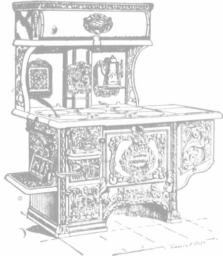
"CORNWALL" STEEL RANGE.

Most furnaces and ranges are built for general use, and sold indiscriminately in both city and country.