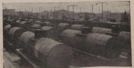
“Imperial Asphalts can be quickly delivered to any part of the Dominion. They come in tank cars or packages, whichever is best suited to your requirements.”

“There are three Imperial Asphalts for road purposes, Imperial Paving Asphalt for preparing Hot-Mix Asphalt (Sheet Asphalt, Bitulithic, Warrenite, or Asphaltic Concrete), Imperial Asphalt Binders for Penetration Asphalt Macadam and Imperial Liquid Asphalts for dust prevention and for increasing the traffic-carrying capacity of earth, gravel and macadam roads.”