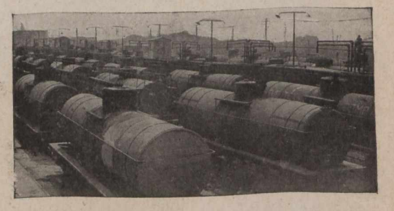
"Imperial Asphalts can be quickly delivered to any part of the Dominion. They come in tank cars or packages, whichever is best suited to your requirements."

"There are three Imperial Asphalts for road purposes, Imperial Paving Asphalt for preparing Hot-Mix Asphalt (Sheet Asphalt, Bitulithic, Warrenite, or Asphaltic Concrete), Imperial Asphalt Binders for Penetration Asphalt Macadam and Imperial Liquid Asphalts for dust prevention and for increasing the traffic-carrying capacity of earth, gravel and macadam roads."