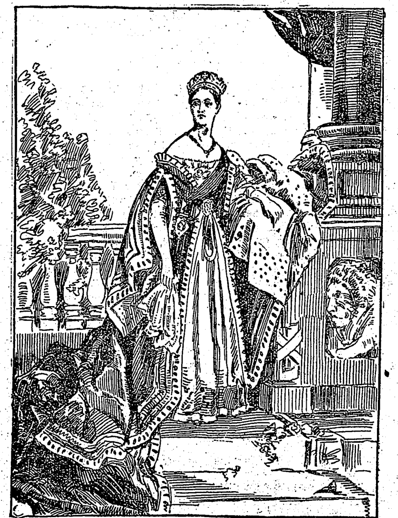
IN CORONATION ROBES.