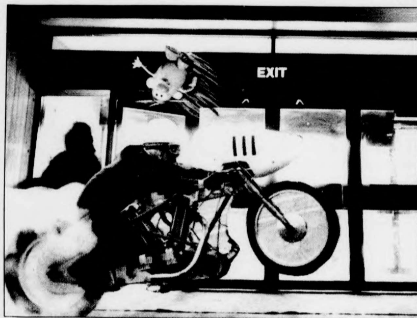
CENTRAL SQUARE SMOKESHOW? Before long, drag bikes will be as common in Central Square as frosh vagrants sucking butts and trying to look cool.

STUDENT, GO HOME. CHEAP. (Face it: you're not going to get any serious studying done around here anyway.)