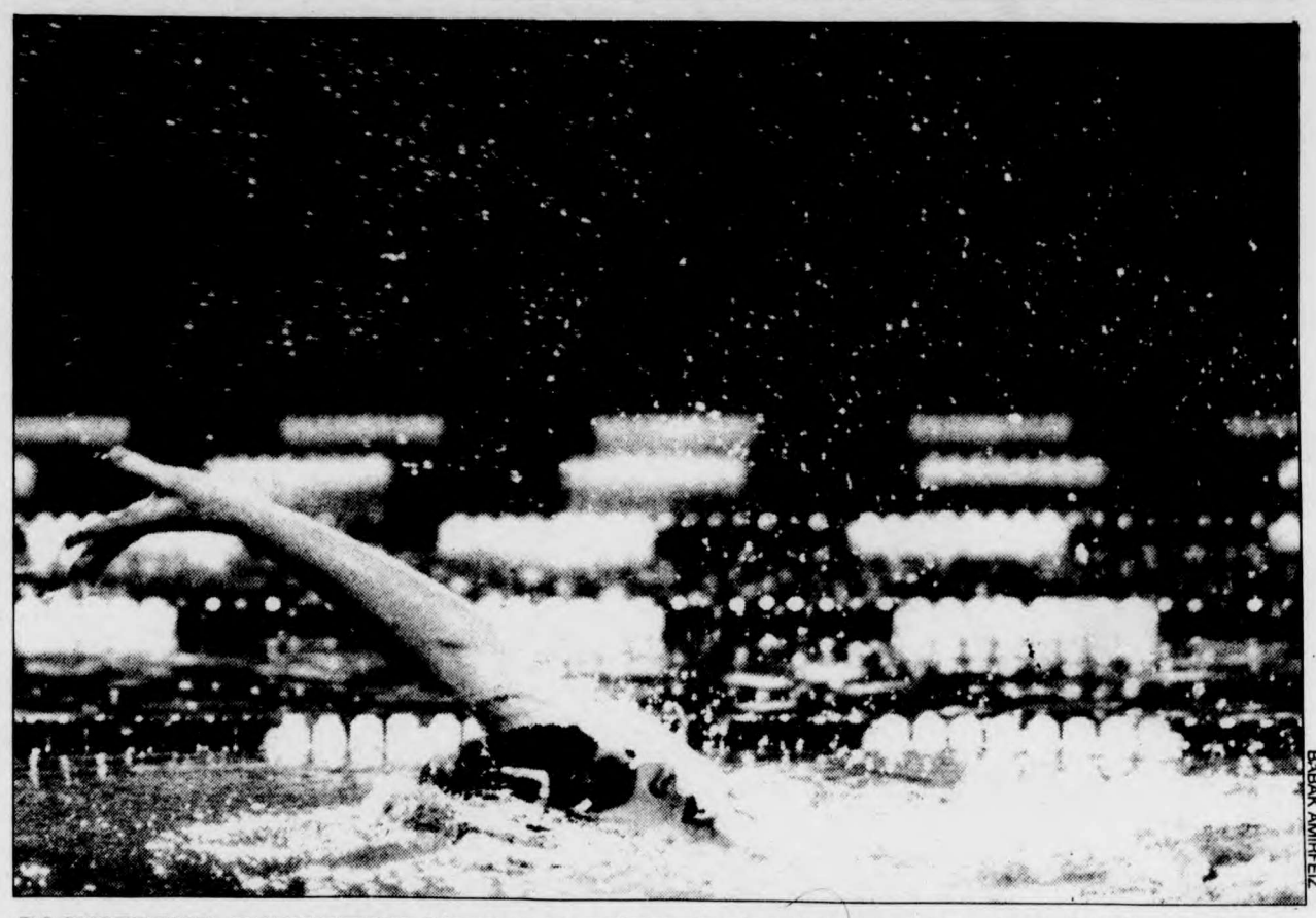
BACKSTROKE, YORK-STYLE: Yeowomen swimmers placed second in last weekend's McMaster Invitational. Yeomen swimmers failed to figure in the points.