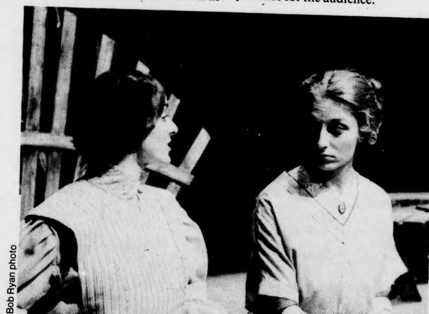
Our Town is at Atkinson studio until Saturday.

Someone in the theatre department is teaching, 'The stage design must be a neutral frame for the actors.' The student designers have taken this idea to the extreme by using every neutral colour in the artist's palette to create a depressing and emotionally debilitating experience for the audience.