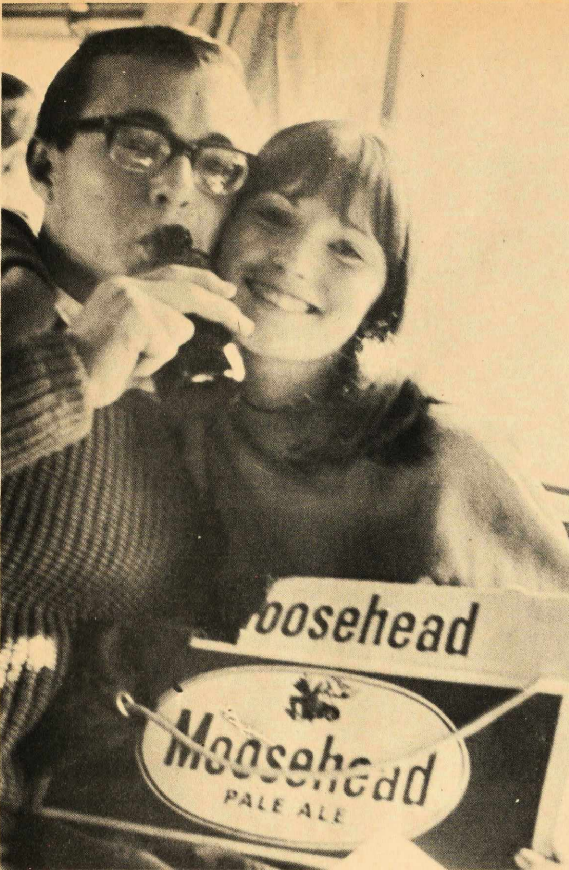
Rolling home from Truro

And what do the students say? One comment overheard in the hall: "People say that the food is better this year and the prices aren't bad. People that don't eat in the canteen that is."